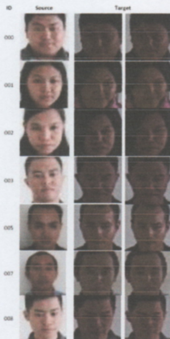
Figure 4. Target of 32 pixel that failed to be identified

The performance of the second scenario can be seen in Table II - Table VI. Based on the results of the five tables, it is known that the model's performance has decreased on the 32 pixel face image and on certain IDs. This can be seen by referring to an ID with a TPR value below 100. The target face image that fails to be identified at a size of 32 pixels can be seen in Figure 4, while for a face image that fails to be identified at a size of 64 pixels can be seen in Figure 5.