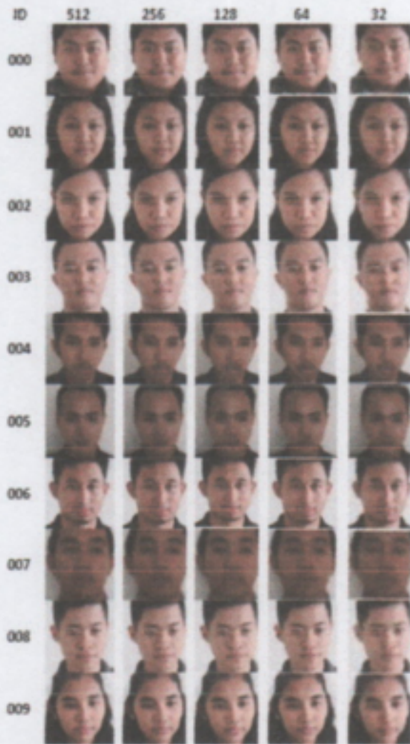
Figure 2. Test data face images for source data

In the evaluation process, the trained ResNet50 model is used to calculate the embedding value of the face images in the source data and target data ( s_a, t_b ). The two embedding values