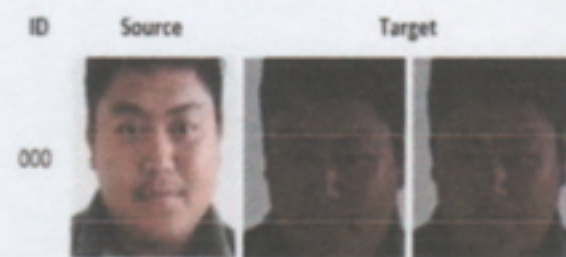
Figure 5. Target of 64 pixel that failed to be identified